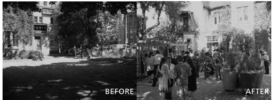
This shows the before and after of the green makeover enjoyed by Factory Theatre thanks to House and Garden TV.